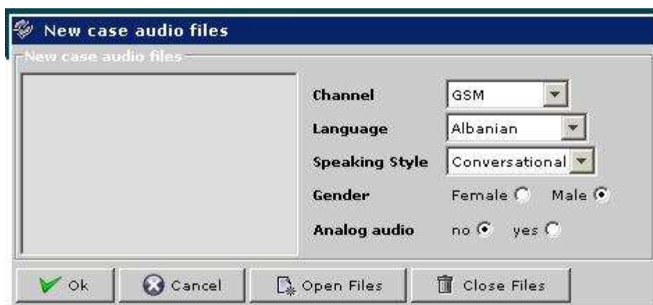
Figure 3: New audios window