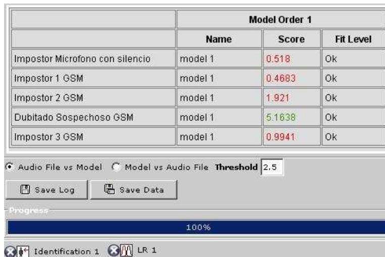
Figure 1: Identification Results window

The system is able to store cases in which, one or more calculations can be run to identify unknown voice samples against a set of known speakers. The identification results consist of a list of potential suspects, ordered from highest to lowest matching scores with the suspect.