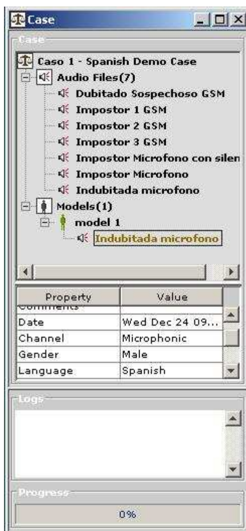
Figure 2: Case window